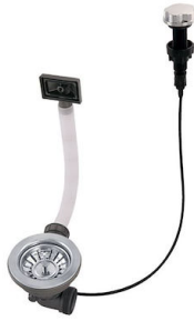
Automatic waste fitting 8407 000