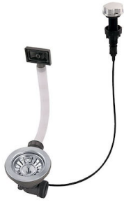
Automatic waste fitting 8407 100