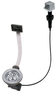
LIRA automatic waste fitting 8407 103