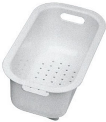
White colander 8151 100